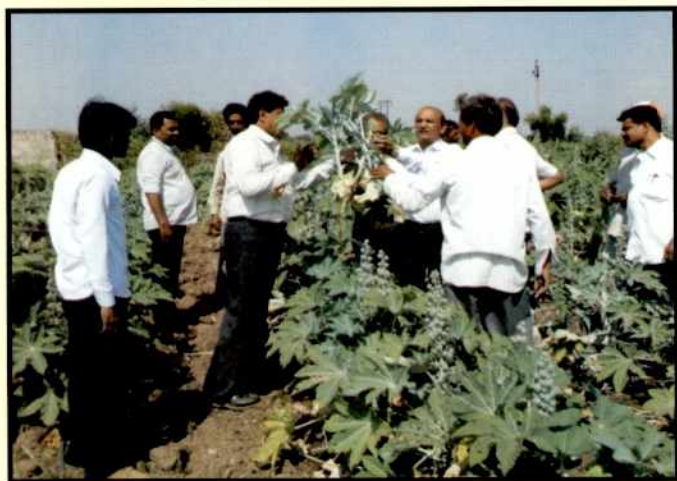
Field visit of scientists and farmers