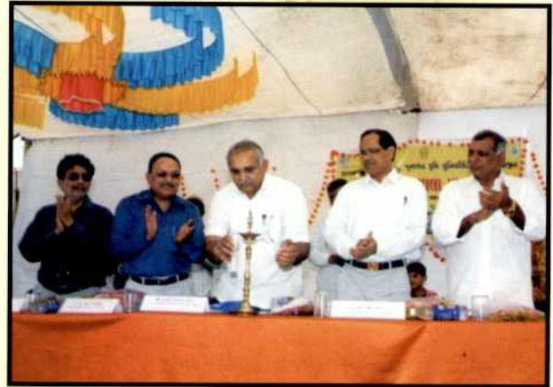
Shri Kanubhai Bhalala, Hon'ble Minister of State for Agriculture and Water Resources inaugurating the seminar