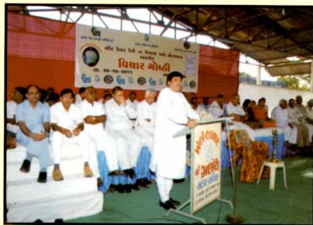
Hon'ble Minister of Agriculture, Shri Deelip Sanghani addressing the farmers

A high level group meeting was organized at APMC, Talala on October 20, 2011 to discuss about the “Development of Gir Kesar mango”. In the meeting it was announced that the famous