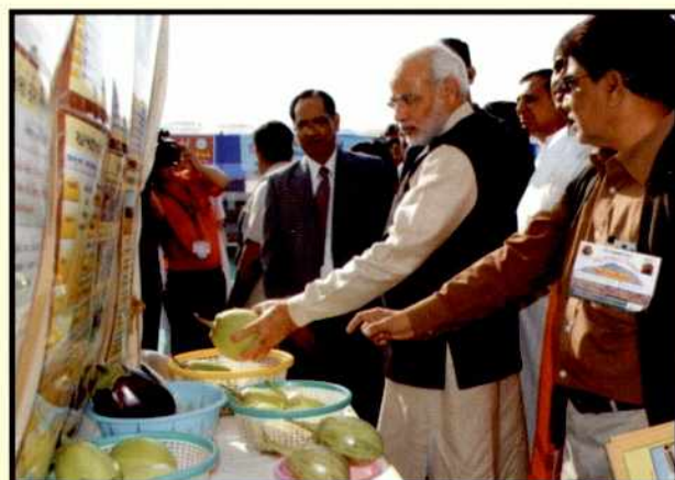
Hon'ble Chief Minister, Shri Narendra Modi visiting the exhibition stall of Vegetable Research Station, JAU, Junagadh during Sadbhavna Mission held at Junagadh on Dec. 22, 2011.

Government of Gujarat has sanctioned the project with total outlay of 17.94 Crores and allocated 30 hectare of land for the implementation of the said project.