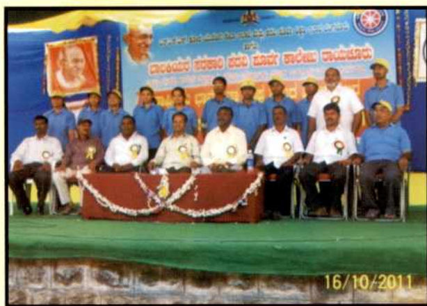
JAU students in National Integration Camp