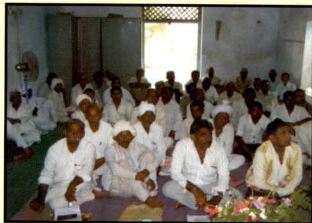
The progressive farmers in the training programme